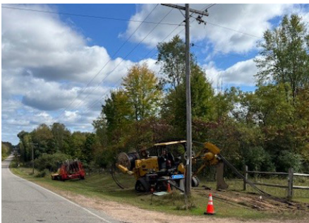
Work began in late September to bury an electric line underground on a 2.5-mile stretch on Fairview Road. Part of the cost of the project will be paid for with a grant that CWEC was previously awarded.

Happy Thanksgiving to each of you and be safe and stay healthy as you enjoy this holiday season.