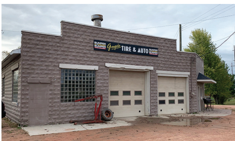
Gage’s Tire & Auto is located on State Highway 45 in Tigerton.

He added, “Shout out to all the people and the local support. It’s been a great community to work with.”