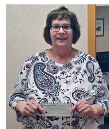
Top row, L to R: Boys & Girls Club of Portage County, Rosholt Extension; Iola Historical Society; Middle row, L to R: Waupaca County Sheriff's Office; Wall of Wittenberg; STAR Treatments. Bottom row, L to R: Hatley Area Fire & Ambulance District; Mamas House of Hope