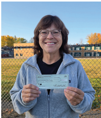
Wittenberg Food Pantry

The funds are held separately from any Central Wisconsin Electric Cooperative funds and are administered by a member Board of Trustees. Applications are made for grants and these are reviewed quarterly for disbursement of funds.