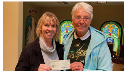
Rosholt Food Pantry