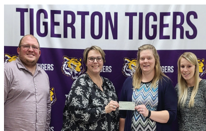
Tigerton School District - MS/HS