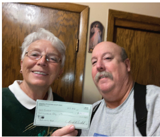
Above: Central WI Order of the Sleepless Knights Parrothead Club Right: Tomorrow River Area Communities Kitchen (TRACK) Food Pantry