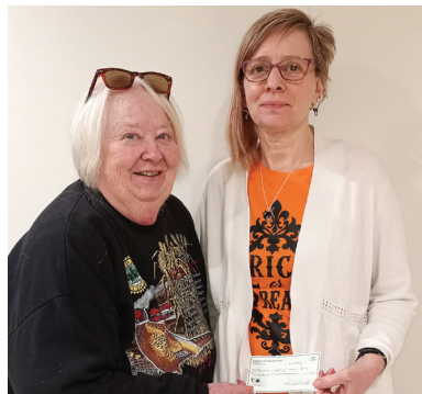
Scandinavia Food Pantry