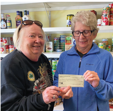
TRACK Food Pantry