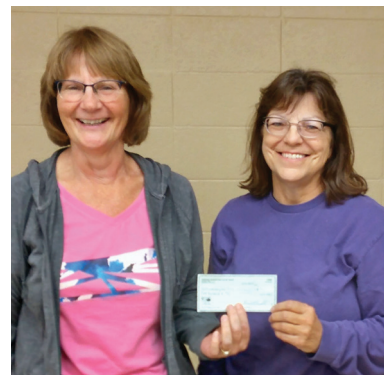
Wittenberg Food Pantry