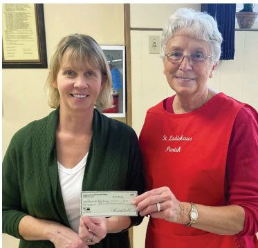
Rosholt Food Pantry