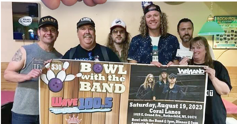
Central Wisconsin Order of the Sleepless Knights

The funds are held separately from any Central Wisconsin Electric Cooperative funds and are administered by a member Board of Trustees. Applications are made for grants and these are reviewed quarterly for disbursement of funds.