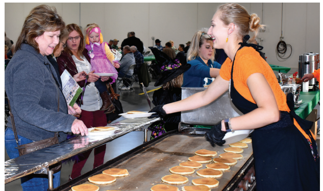
Above left: Attendees enjoyed pancakes, sausage, and cake.