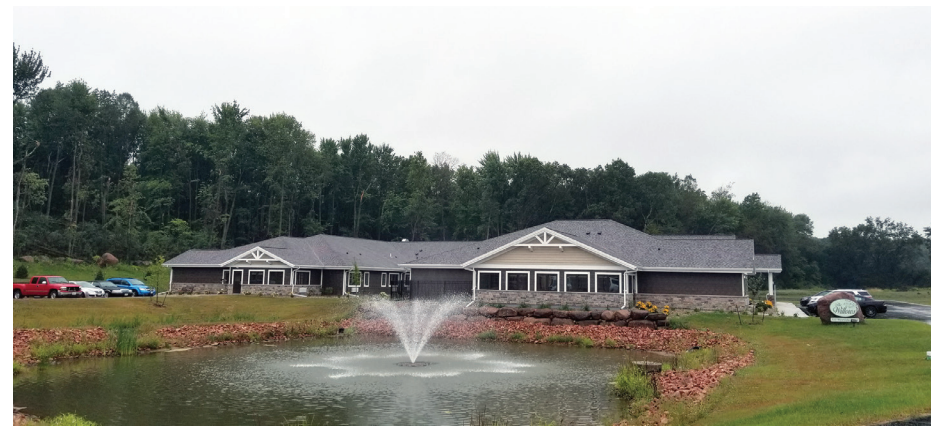
The Willows is surrounded by forest and wildlife.

The facility has many amenities that makes The Willows feel like home. They offer licensed nurses and care providers 24 hours a day. The Willows also offers spacious private rooms that include private bathrooms. All the rooms have their own thermostat so residents can have full control of the temperature. The Willows provides in-house therapy and