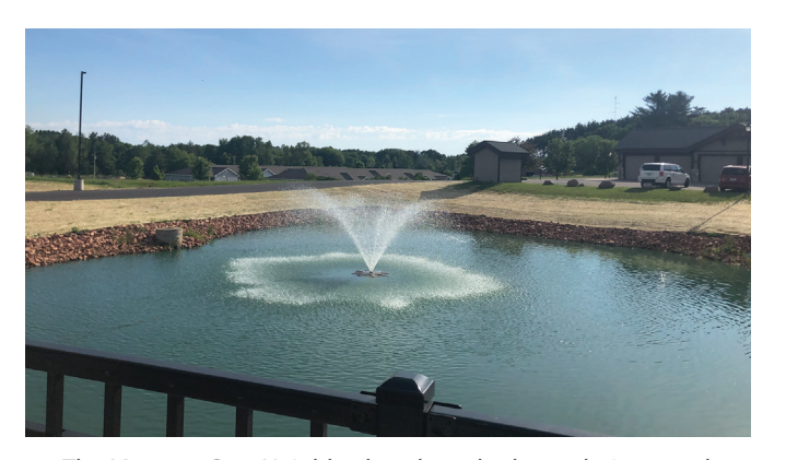
The Memory Care Neighborhood overlooks a calming pond.

The Willows offers homey, quiet rooms to accommodate every resident's needs. The community-based residential facility offers comfort, many activities, and specially trained staff. For more information, or to schedule a tour, call 715-445-4487.