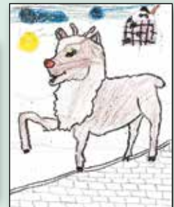
$10 Winner – Kaydence Burclaw