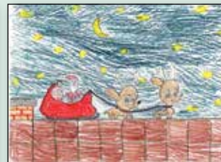
$15 Winner – Gracie Casper